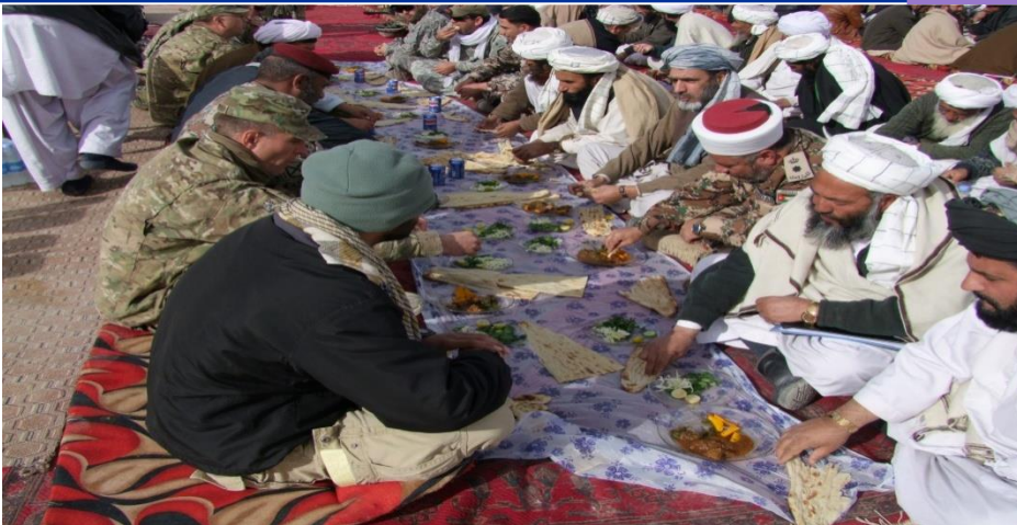
Attendees eating lunch

Commander's Assessment: This is the first meeting and we will continue to hold this kind of religious meeting which has great impact because the TB blend well into Afghan society and are using mosques as their platform for dispersing their vicious,extermist and twisted theology.