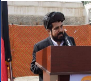
Deputy of Governor