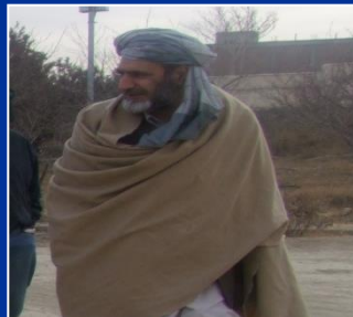
director of Hajj

Commander's Assessment: This is the first meeting and we will continue to hold this kind of religious meeting which has great impact because the TB blend well into Afghan society and are using mosques as their platform for dispersing their vicious,extermist and twisted theology.