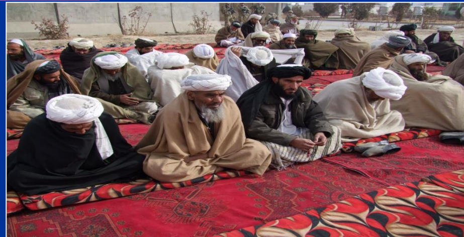
The first Religious Seminar attendees