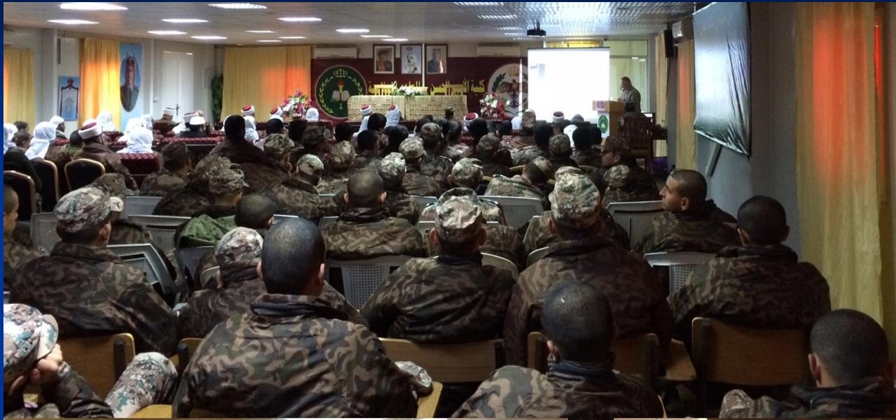
Chaplain / Imam Exchanges