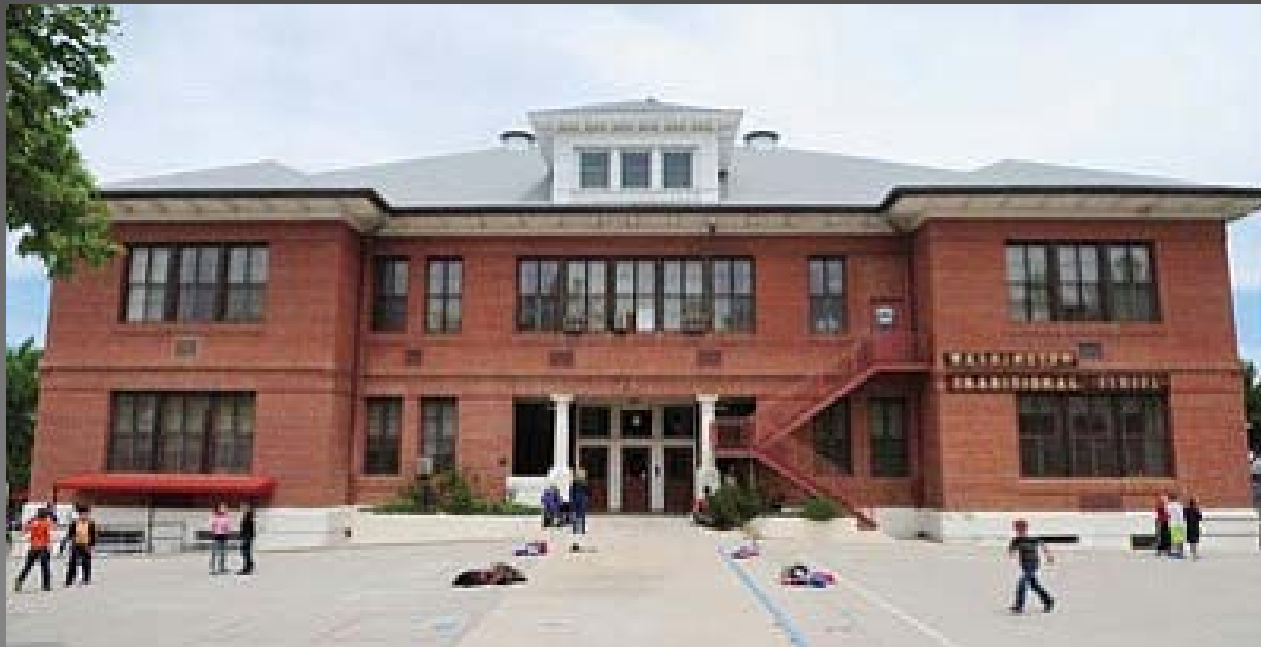
Washington Elementary School Prescott, Arizona