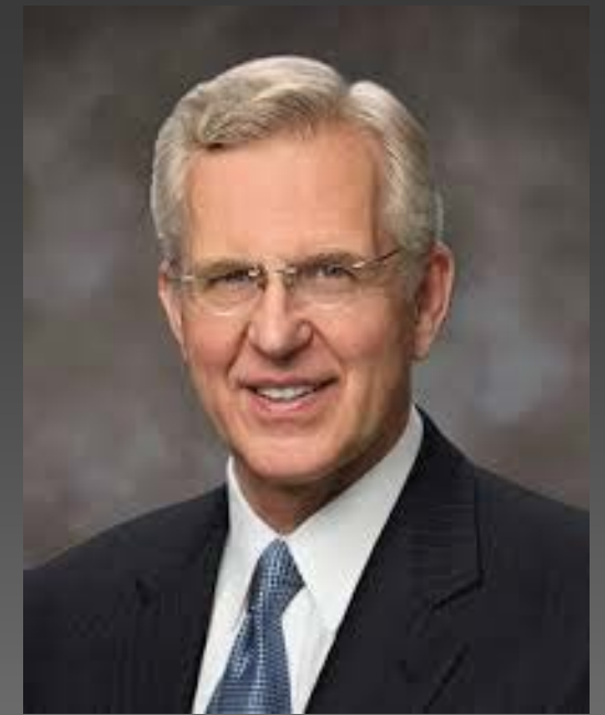
ELDER D. TODD CHRISTOFFERSON

“As a consequence, self-discipline has eroded and societies are left to try to maintain order and civility by compulsion. The lack of internal control by individuals breeds external control by governments. . . . There could never be enough rules so finely crafted as to anticipate and cover every situation, and even if there were, enforcement would be impossibly expensive and burdensome. This approach leads to diminished freedom for everyone. ”